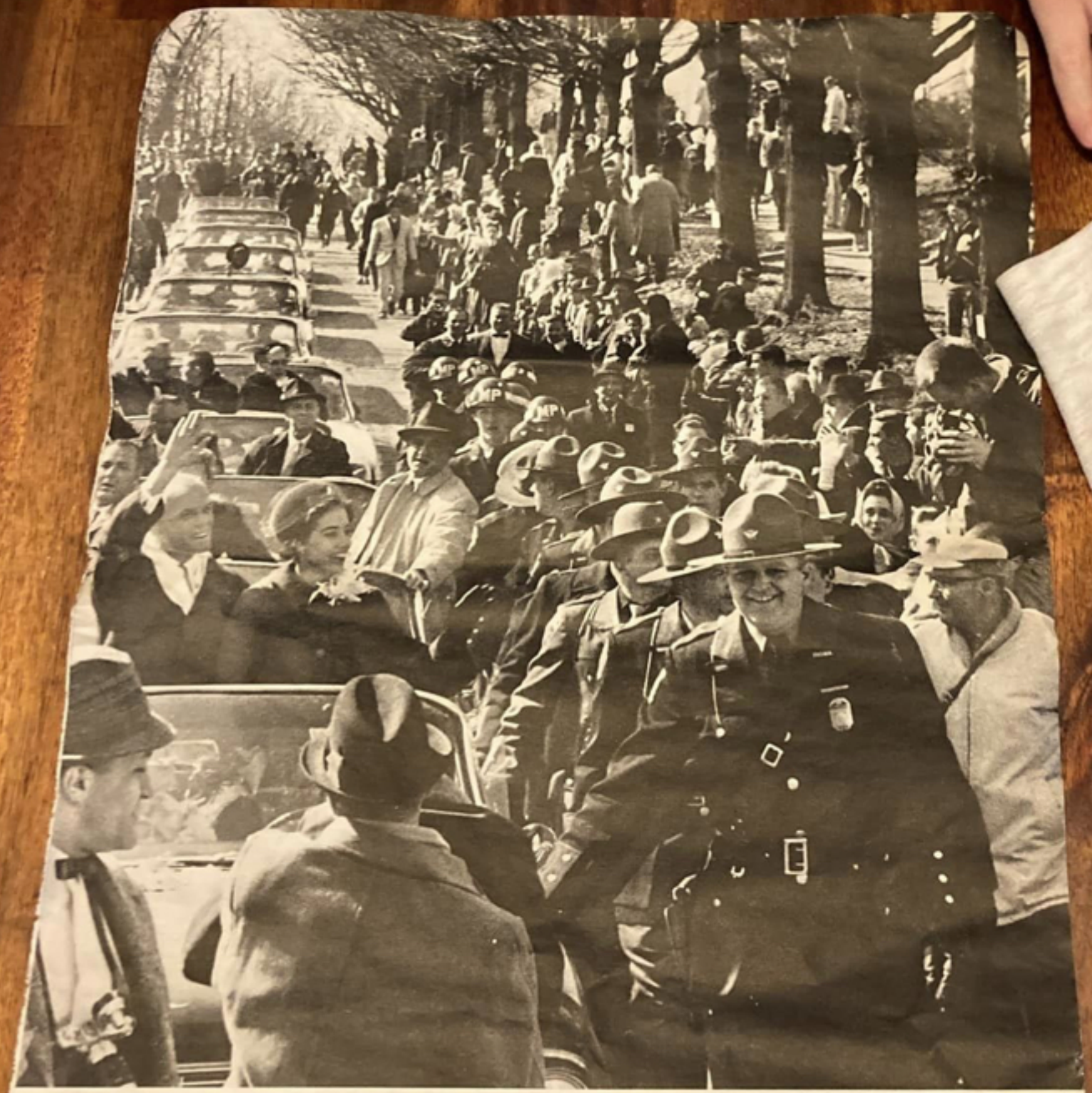
Johnny Comes Marching Home . . .