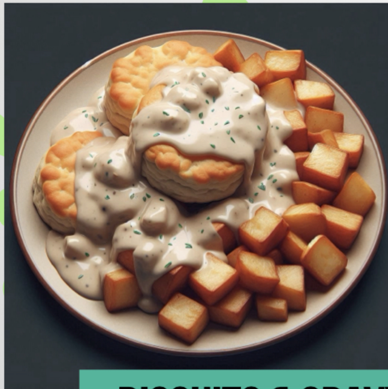
BISCUITS & GRAVY